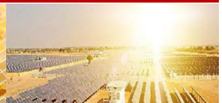
2.1MW Project in New Delhi, India