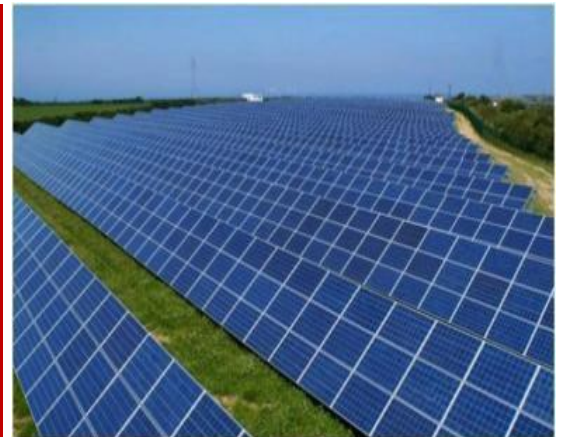
274 MW project in Ontario, Canada

Our project capabilities and advantages are one stop solar service, from the project development through to EPC and O&M, an extensive knowledge base and tier 1 quality standards.