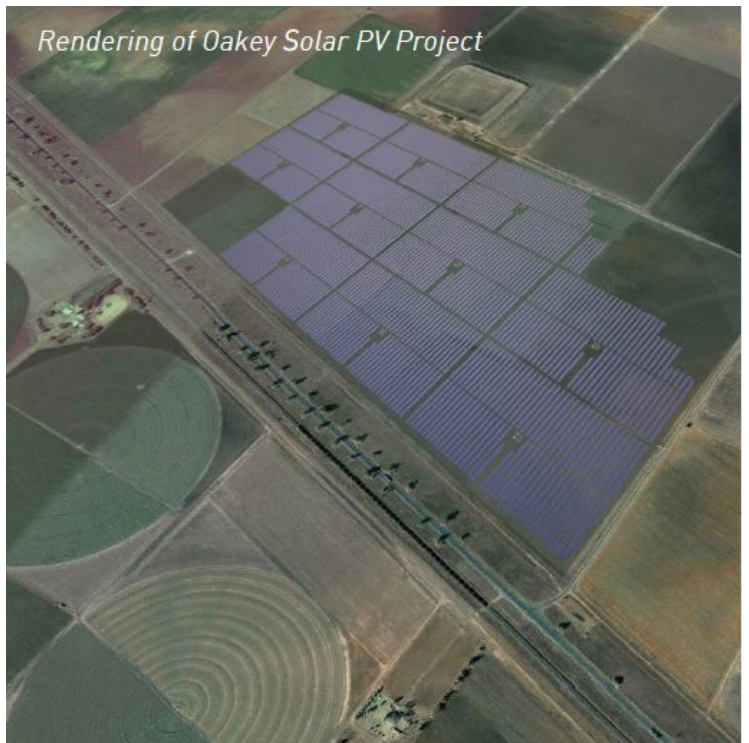
Rendering of Oakey Solar PV Project

The project will begin construction in June 2017 and once operational will generate enough energy to power approximately 24,000 homes