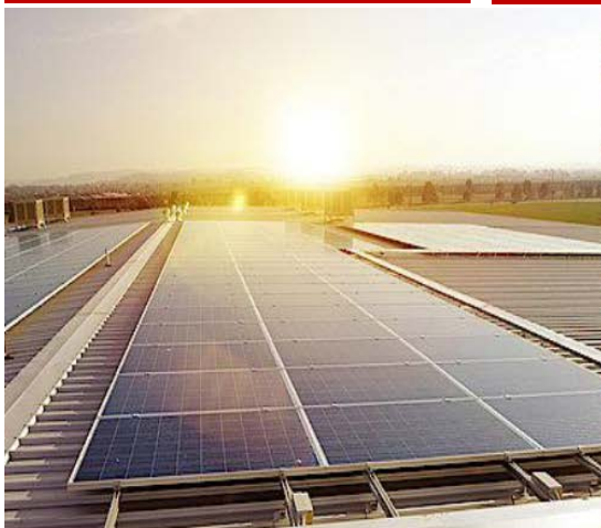
3.6MW Project in Australia

Level 1, 165 Cremorne Street, Richmond, Melbourne, VIC, 3121 www.canadiansolar.com/au Tel: +61 3 8609 1844