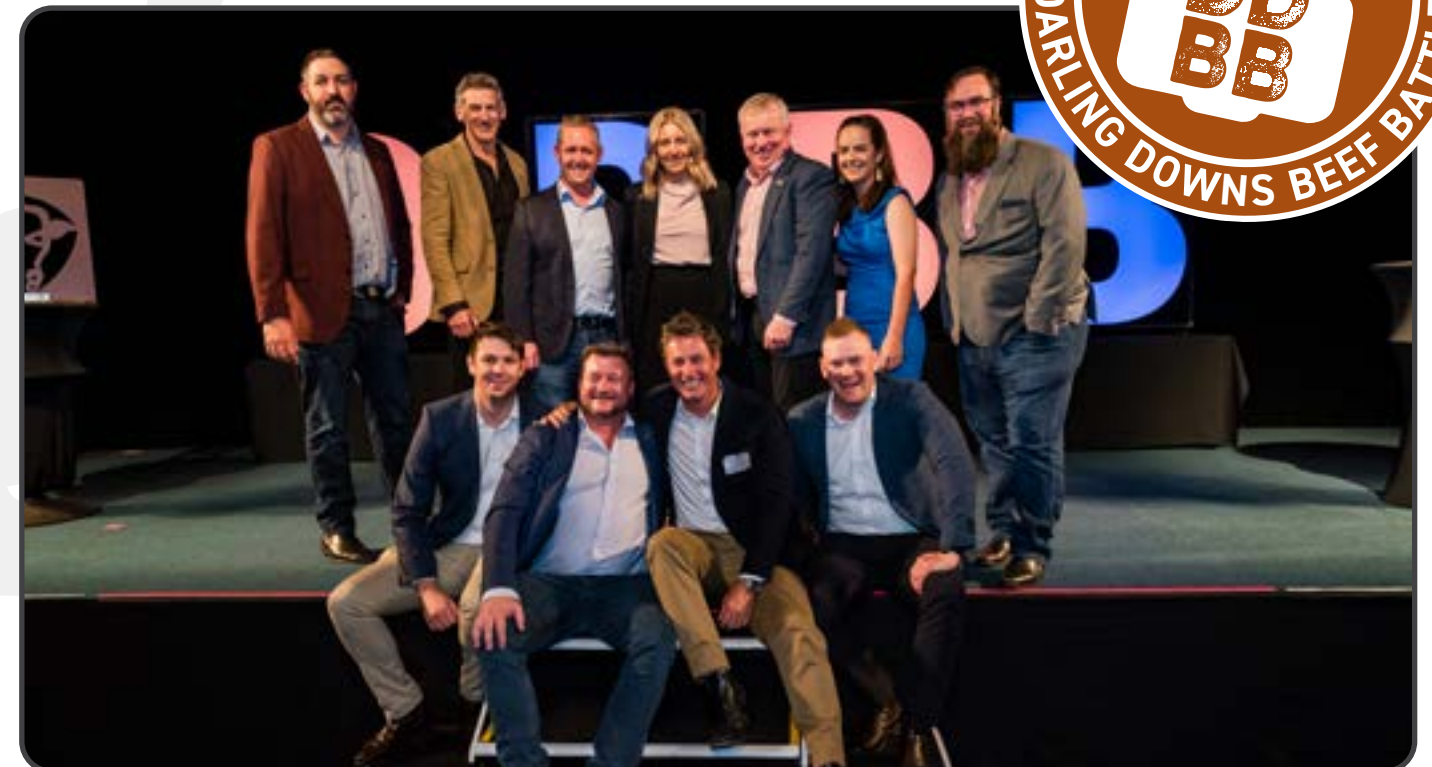
2024 PEOPLE'S CHOICE STANBROKE