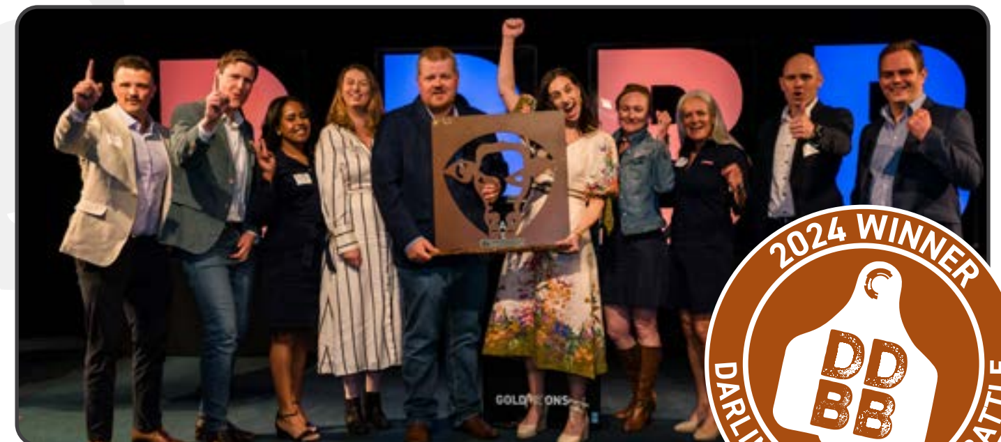
2024 WINNER STOCKYARD