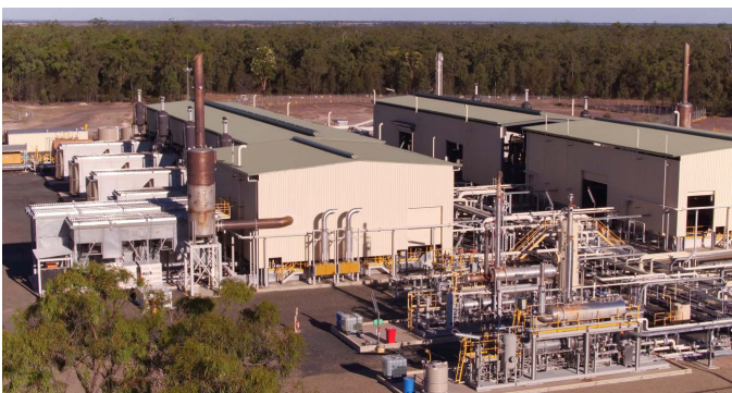
Daandine Power Station