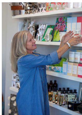
Lisa Kennedy Designs in Miles