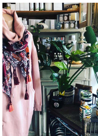
Bella & Spice in Dalby