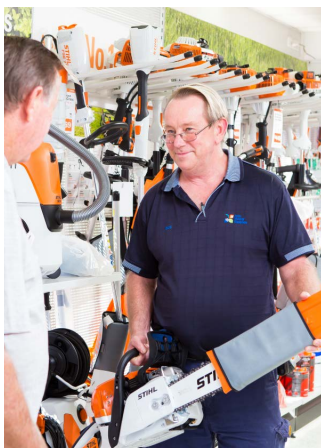
Dalby Mower Supplies