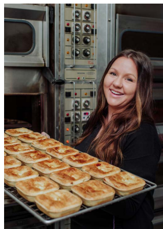
Maces Bakery in Miles