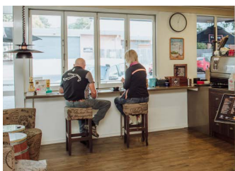
Chinchilla Downtown Cafe

Thanks to the resources sector, the Gross Regional Product (GDP) has increased by 34% over five years to reach nearly $4.07 billion