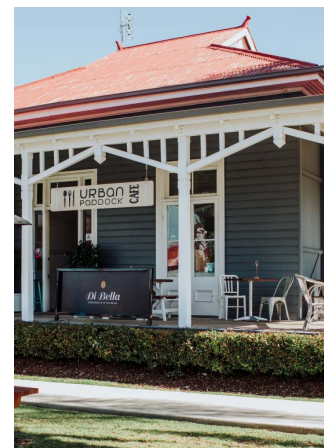
Urban Paddock in Dalby