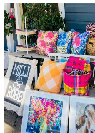
Milli & Robe in Dalby

Dalby's central location makes it ideal as our service centre and gateway to the region. Around 56% of Western Downs' retail trade workers are located in the town.