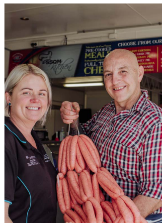
Dalby Southside Butcher